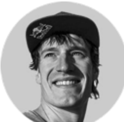
Sebastian Kienle Ironman World Champion